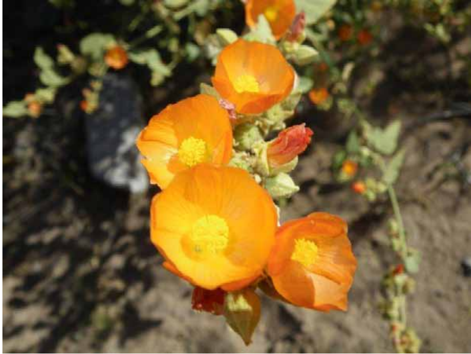
March 26 – Out to west coast at Laguna San Ignacio for whale watching tour.