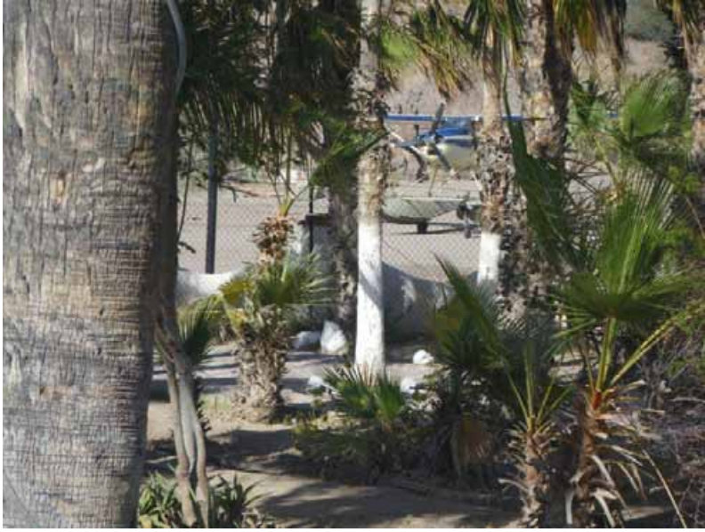
March 25 – Beach walk north town.